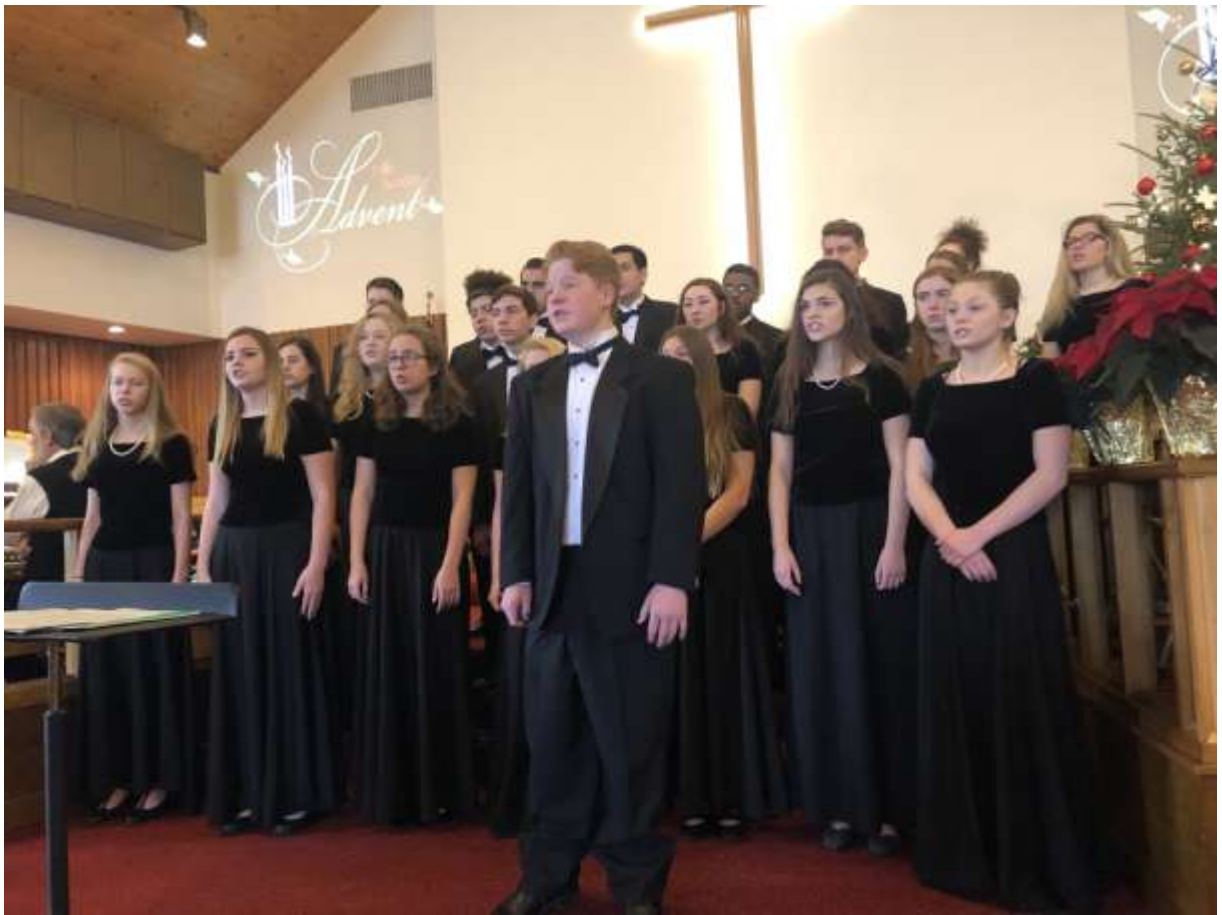
SOUTHERN LEHIGH MEISTERSINGERS