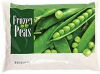
FROZEN FOOD BAGS