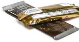
CANDY BAR WRAPPERS