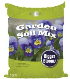
MULCH OR SOIL BAGS