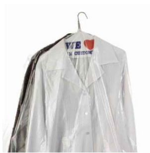
DRY CLEANING BAGS