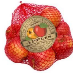
NET OR MESH PRODUCE BAGS