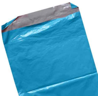
PLASTIC SHIPPING ENVELOPE