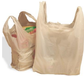
FILM GROCERY BAGS