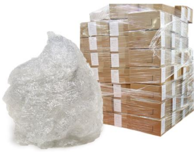
PALLET WRAP & STRETCH

All plastic must be clean, dry and free of food residue.