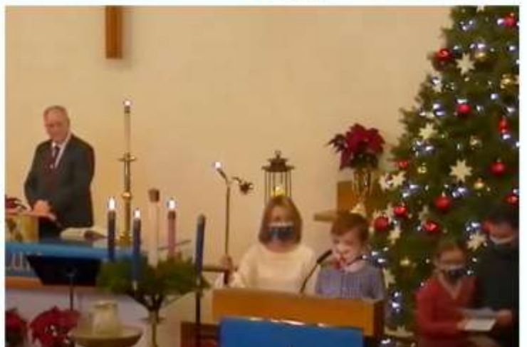
CE Christmas Program, 12/19/21